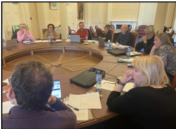
Truth Recovery Independent Panel members pictured above at one of their meetings in Stormont Castle.

The integrated truth investigation will be comprised of two discrete, but integrated phases: a non-statutory Independent Panel and a full statutory Public Inquiry.