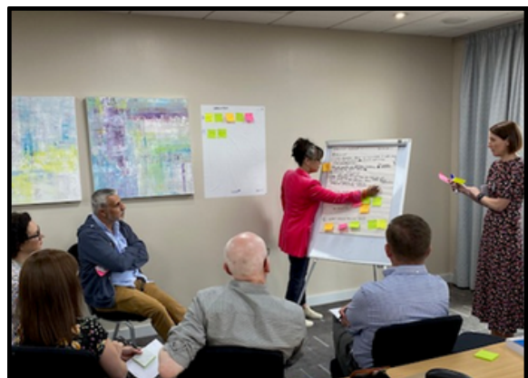
Pictured above, Independent Panel identify key areas of work.