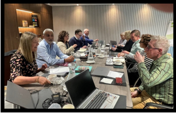
Independent Panel In-Person Meeting in April 2024, Europa Hotel